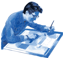
research and advocacy

We're building an Edmonds where all people have the opportunity to thrive .